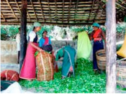
Tamil women working in a tea factory, Sri Lanka advertisement